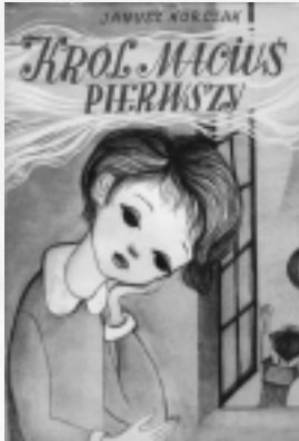
King Matt the First book cover, Janusz Korczak Association of Canada.

ON AUGUST 6, 1942, THIS DOCTOR, WRITER AND EDUCATOR WAS FORCED TO GATHER TOGETHER THE 200 JEWISH ORPHANS UNDER HIS CARE IN THE WARSAW GHETTO. REFUSING ALL OFFERS FOR HIS OWN SAFETY, HE LED THEM WITH QUIET DIGNITY TO THE TRAM THAT WOULD TAKE THEM OUT OF THE WARSAW GHETTO. THEY WERE TAKEN TO TREBLINKA, AN EXTERMINATION CAMP IN OCCUPIED POLAND WHERE THEY PERISHED TOGETHER IN THE GAS CHAMBERS.